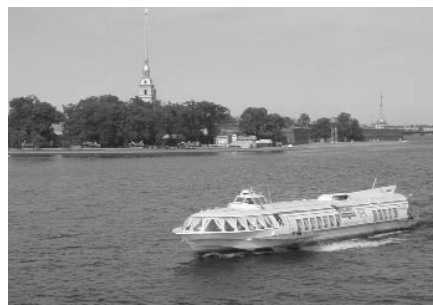
St. Petersburg images reproduced with the permission of Mr. Peter Sobolev http://www.enlight.ru/camera/